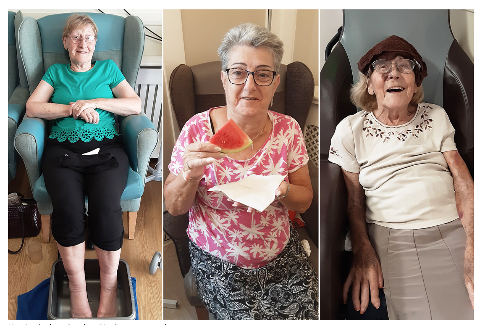
Keeping hydrated and cool in the warm weather