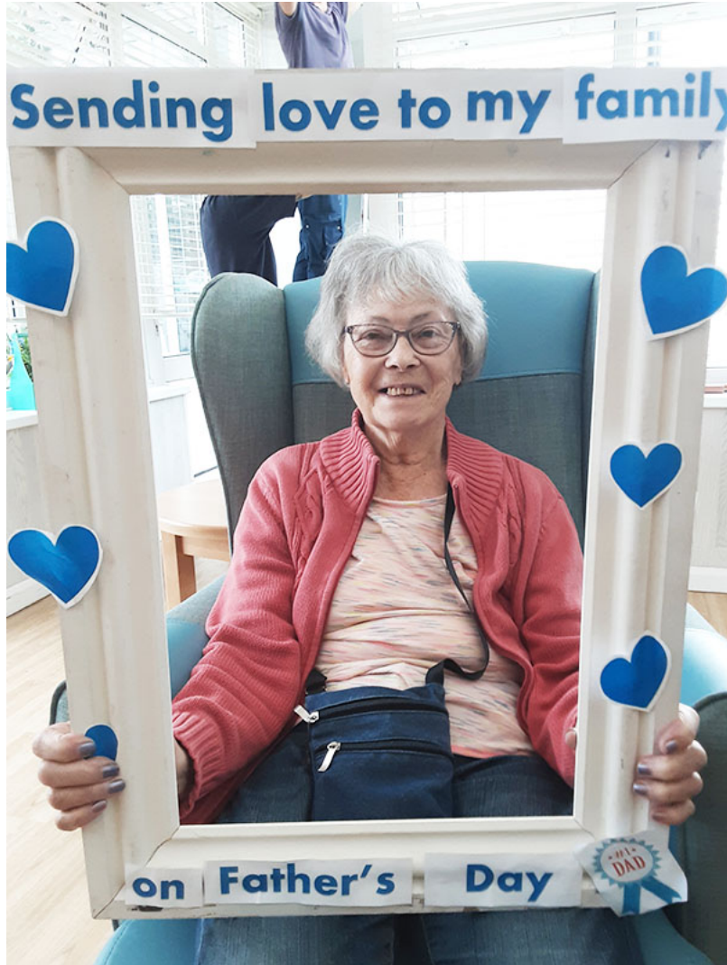
Sending love for Father's Day